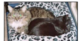
Blitzen & Ichi Mimi (One Eye) Re-homed!

We've set up a wall to showcase some of the homeless cats that come through our clinic. Please send us your pictures and a sentence about who they are. And be sure to take a look when you're by the clinic - it's a nice reminder of who we're helping!