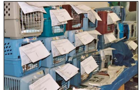
A busy clinic day. Kitties are through surgery, recovering in their carriers and awaiting pick up by their caretakers.

This momma cat has already had countless litters. Spaying her today, improves her health & quality of life, while sparing new kittens from perishing alone.